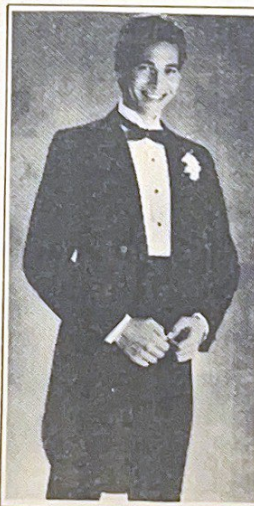
Pierre Cardin Bill Blass.

DURING PROM SEASON, IT'S LOOKS, NOT BOOKS.