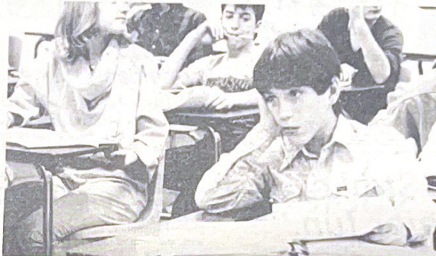
Daydreaming about extracurricular activities may become a thing of the past if the No Pass-No Play rule is upheld.